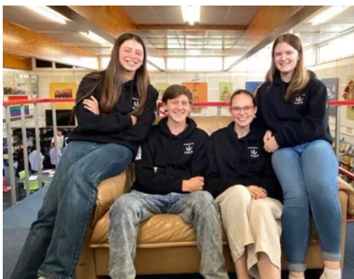
Kāpiti College Services Committee