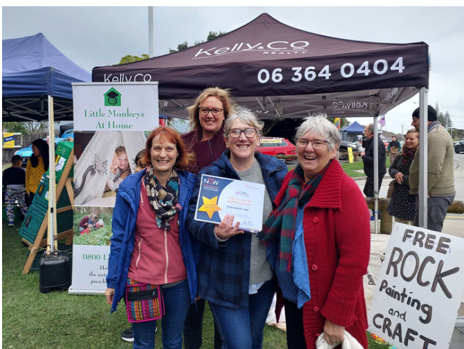
The Ōtaki Market Volunteer Team