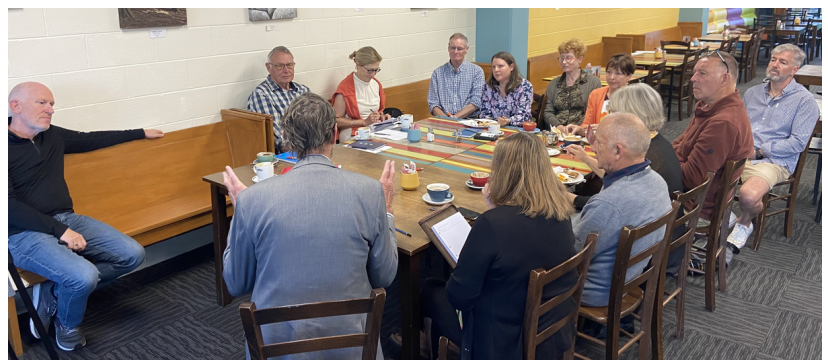
Kāpiti Community Governance Breakfast