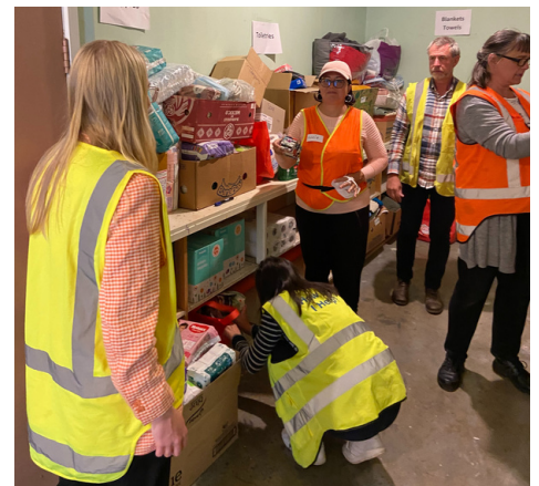
Cyclone Relief Volunteers sorting donations from the Kāpiti Community