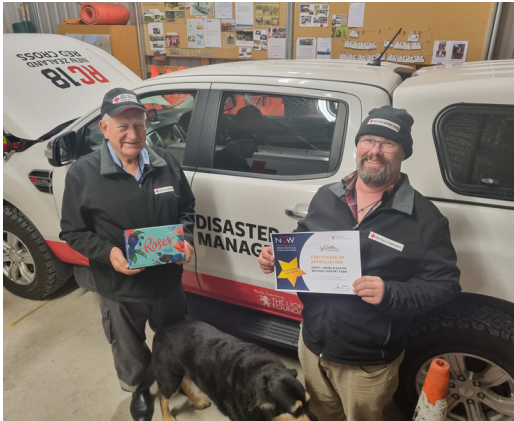
NZ Red Cross Disaster Welfare Support Team Volunteers