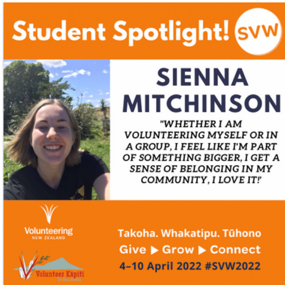
One of our social media campaign posts during Student Volunteer Week 2022

Other highlights this year included celebrating Student Volunteer Week 2022, completion of the pilot Governance Mentoring Programme and increasing engagement in Ōtaki and with local rangitahi.