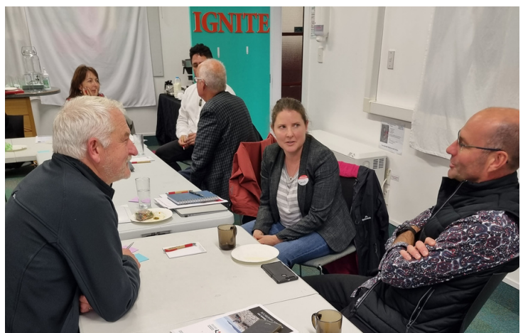
Community Governance Mentoring participants at a meet up