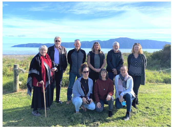
The Volunteer Kāpiti Team