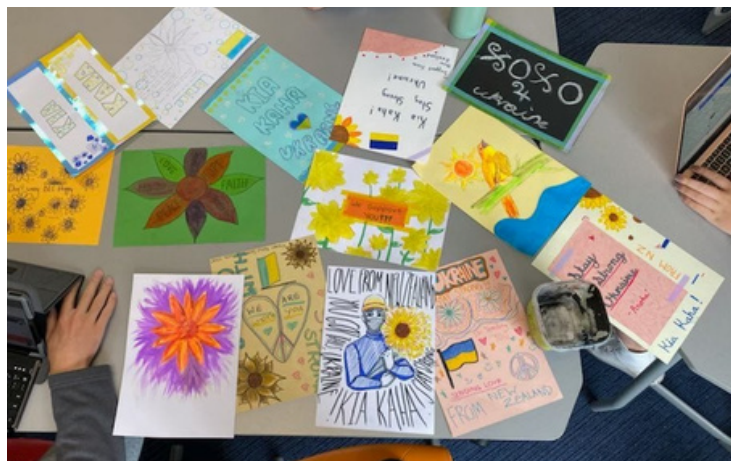
Paraparaumu College students sending messages of support to Mahi for Ukraine

Other highlights this year included celebrating Student Volunteer Week 2022, completion of the pilot Governance Mentoring Programme and increasing engagement in Ōtaki and with local rangitahi.