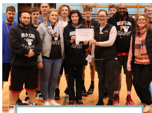
Hoop Club Kāpiti