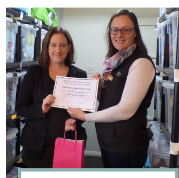
Little Sprouts Kāpiti