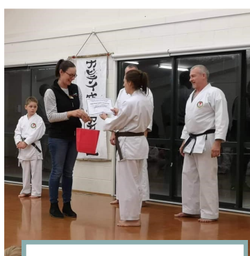
Kāpiti Karate Academy